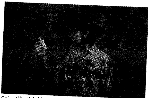
Scientific thinking can help you decide whether the claims of a product are accurate.

To think scientifically, you should be skeptical of the claim in the advertisement. You should learn more about the ingredients in the pill. You may learn that some of the ingredients in the pill can be harmful. By thinking scientifically, you can reduce the chances that you will take a pill that could make you sick.