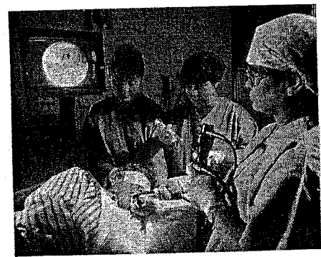
When scientists carry out investigations, they must behave ethically.